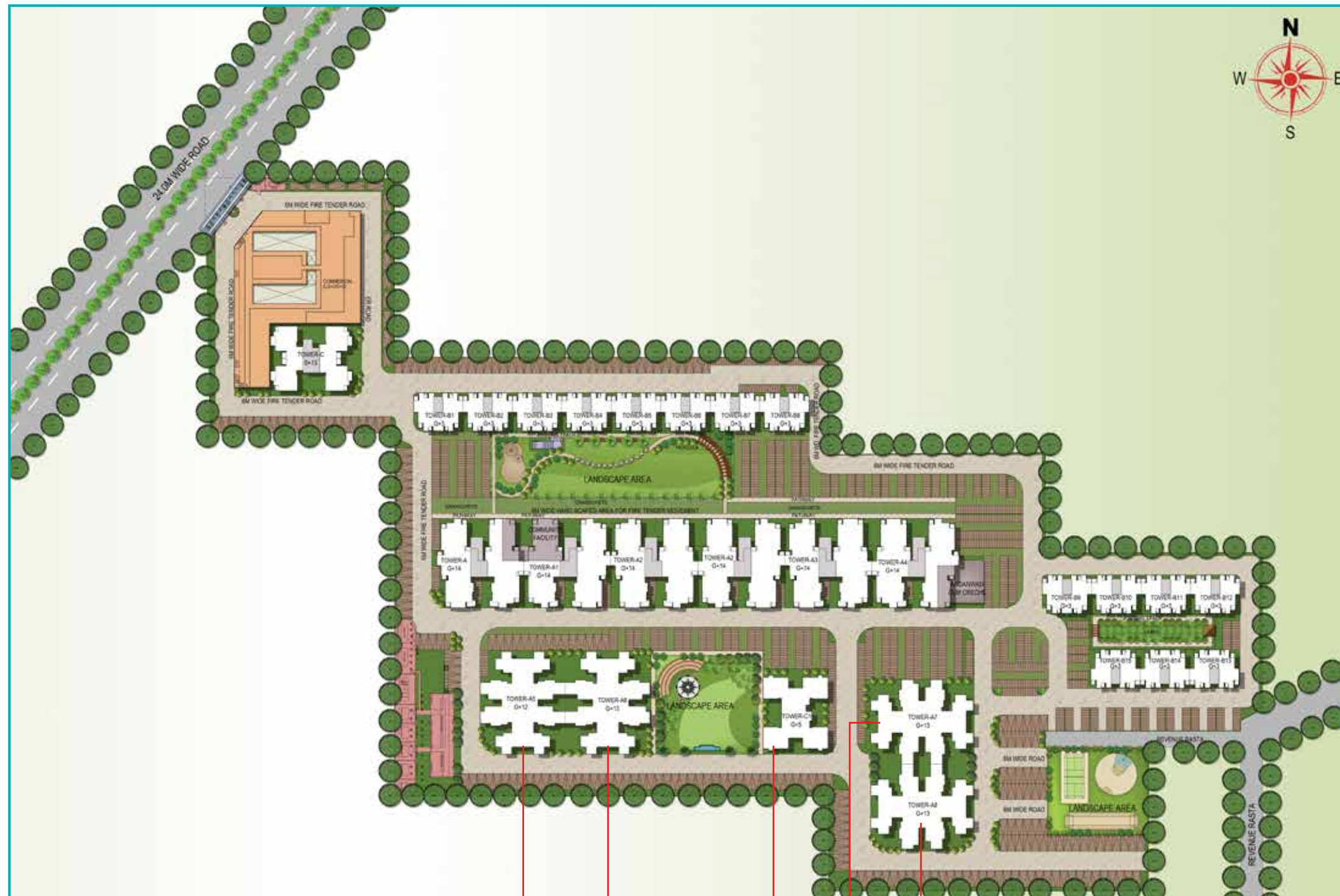
Artistic Site Plan