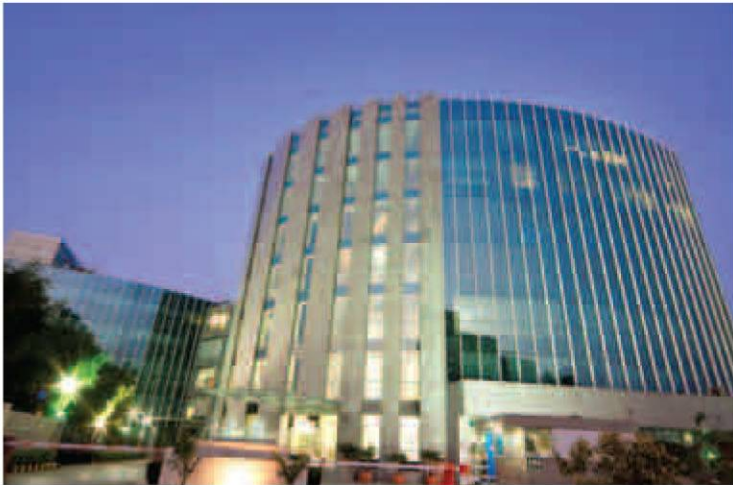
Ocus technopolis Golf Course Road, Gurgaon.