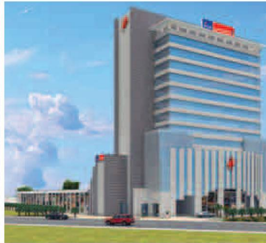
Ocus technopolis 2, Sec 51, Gurgaon.